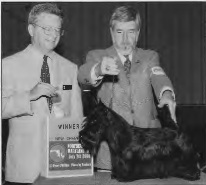
AM/CAN CHAMPION vWD DNA not tested LOCHMAREE HERSHEY KISS