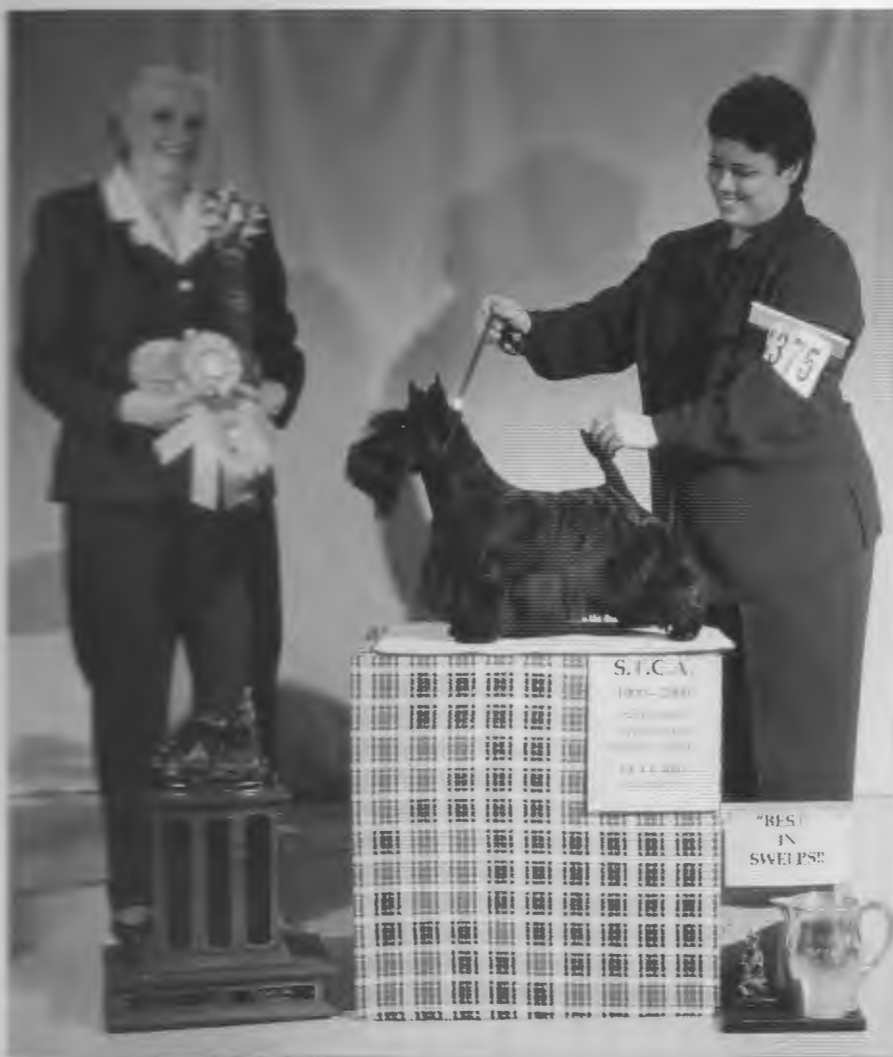
(Brookhill Sandgreg's Crusader x Ch. Jovial's Heart of Gold of McVan)