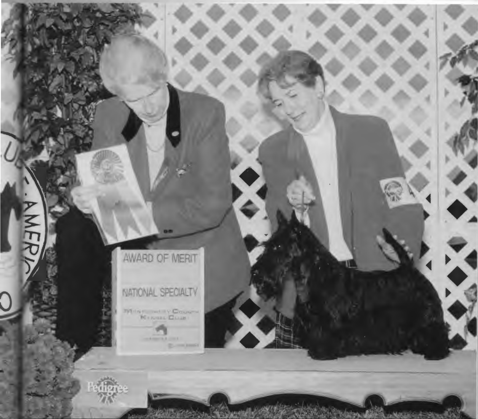
CH. LOCHMAREE PUTT'N ON THE RITZ