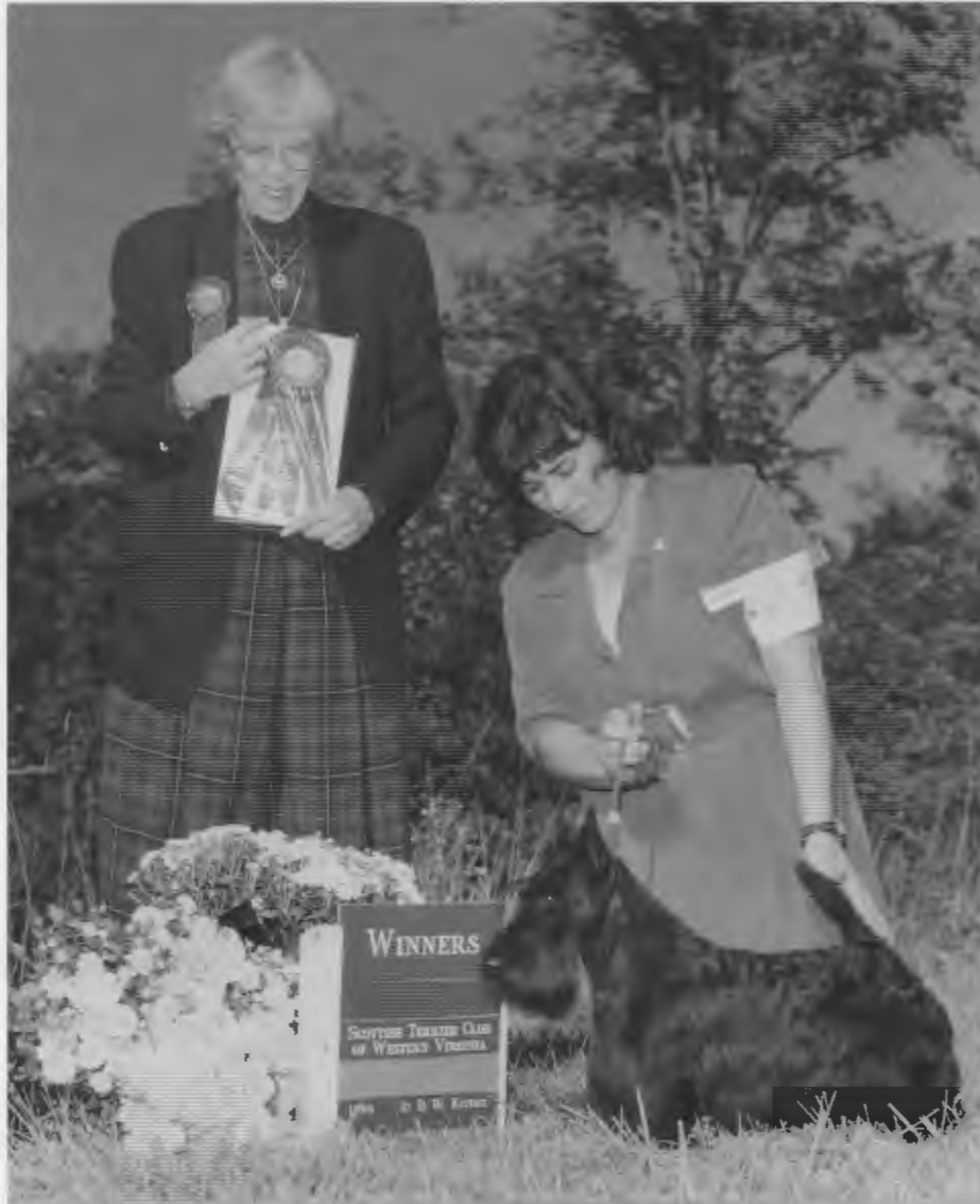
(Ch. Caevnes Devils Due x Ch. McVan's Nut N Honey) Parents vWD DNA Tested Clear

Duke is the Sire of Peggy Sue's One and Only litter; ALL of which finished!!