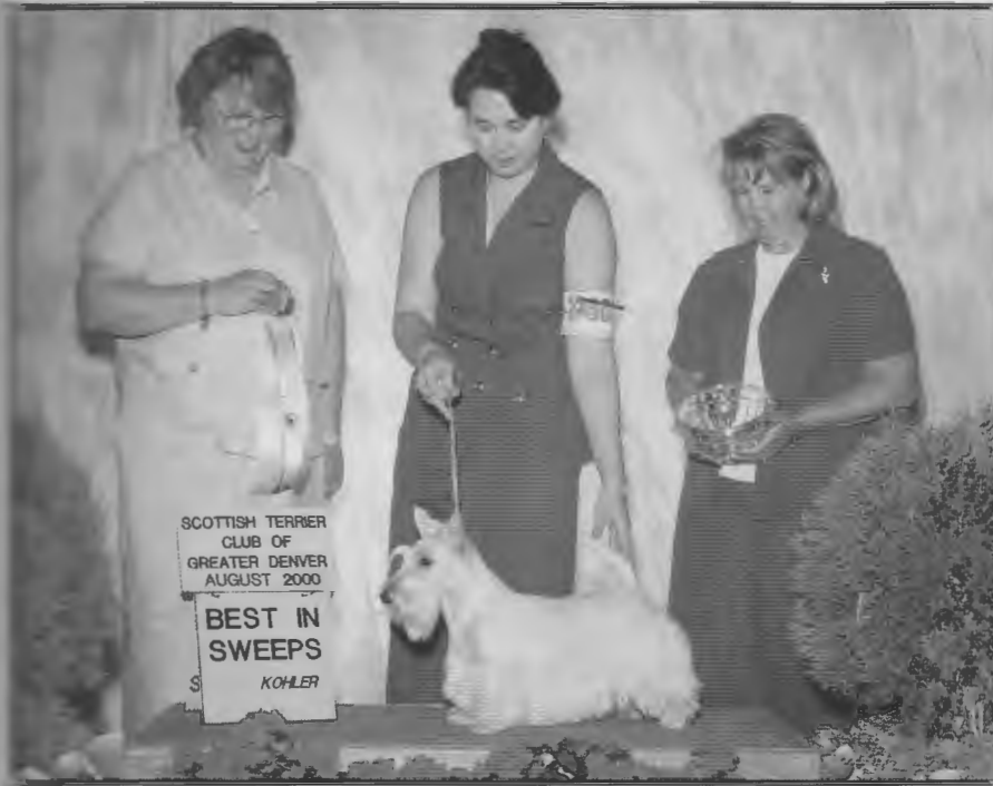
Ch. Hycourt's Take the Money N Run x Hycourt's Pride and Prejudice Parents vWD DNA Tested Clear