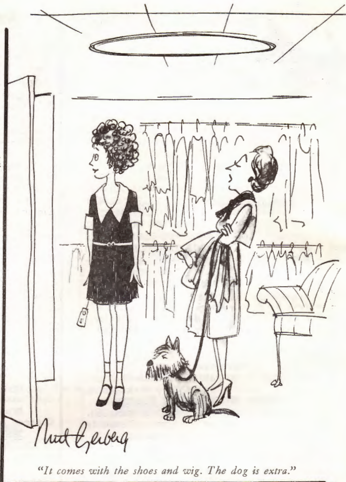
"It comes with the shoes and wig. The dog is extra."

DON'T FORGET TO GET YOUR CLUB NEWS TO THE EDITOR