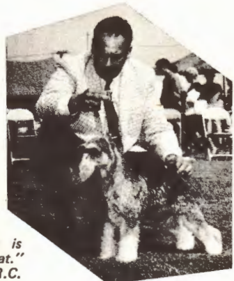
"A good amateur is terribly tough to beat." R.C.