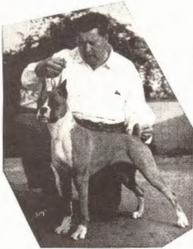
"Go to the pound for soundness."