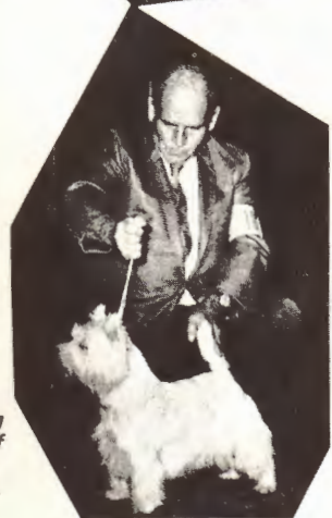
"Knowing when a dog is in condition is half the battle."